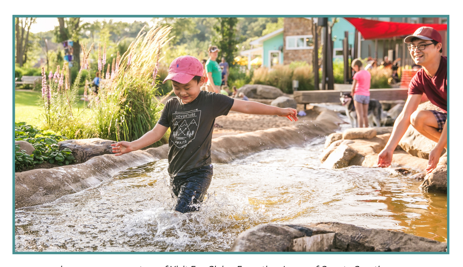
image source: courtesy of Visit Eau Claire. Exception: Image of County Courthouse

Confidentiality must be requested by the applicant and cannot be guaranteed for finalists.