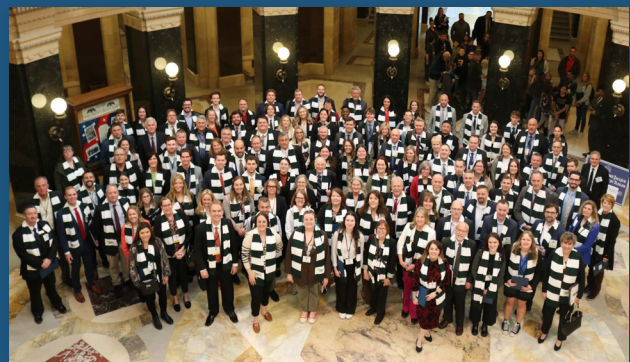
Chippewa Valley Rally, 2025, Capitol Rotunda

We come to Madison each year to recognize and strengthen our region's mutually-beneficial relationship with state government – including transportation, workforce development, education, economic development, and more.