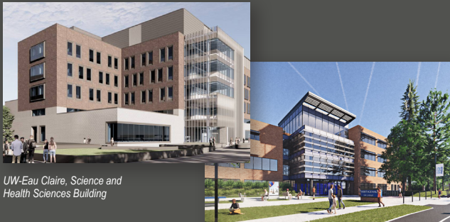
UW-Eau Claire, Science and Health Sciences Building