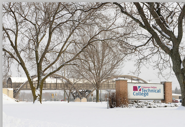
Chippewa Valley Technical College

Increase funding opportunities for Chippewa Valley Technical College and other Wisconsin Technical College System colleges to support community critical programming. CVTC and colleges within the Wisconsin Technical College system are laser-focused on mission to provide the necessary education and training to support a strong economy and economic mobility for our citizens. The conservative WTCS budget request for the current biennium was not included in the State budget. This funding for technical colleges across the state, including Chippewa Valley Technical College, is critical for the continuation of programming essential to Wisconsin communities for quality of life, economic sustainability and growth potential. Many of these high-cost program offerings have experienced rising costs for supplies and delivery while statute-authorized determination of tuition rates have not kept up to balance operational costs of the College. These programs include emergency medical services (EMS), welding, nursing and other healthcare offerings, truck driving, etc. In addition, as employee retention continues to be a challenge for many institutions, our ability to provide cost of living increases for our faculty and staff have been impacted. enhance instruction and operations. This funding is essential to ensure all eligible technical college students can access Wisconsin grants without being turned away due to insufficient resources.