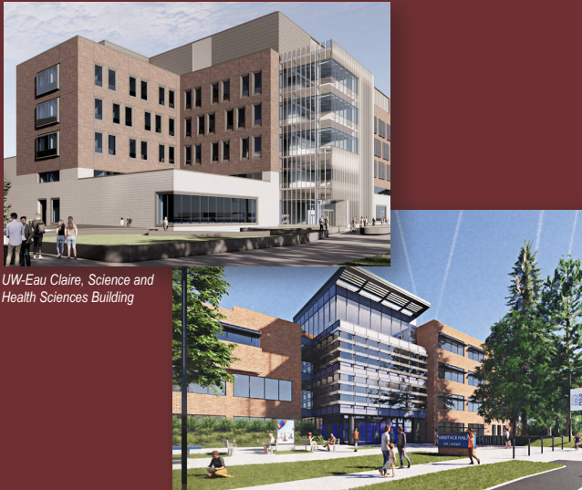
UW-Eau Claire, Science and Health Sciences Building