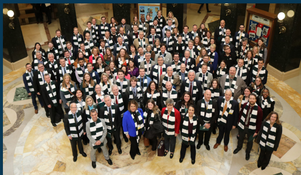
Chippewa Valley Rally, 2024, Capitol Rotunda

We come to Madison each year to recognize and strengthen our region's mutually-beneficial relationship with state government – including transportation, workforce development, education, economic development, and more.