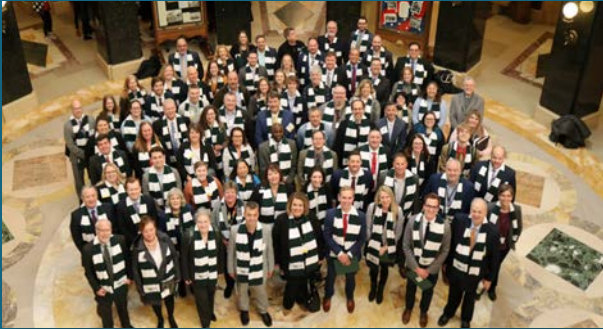
Chippewa Valley Rally, 2023, Capitol Rotunda