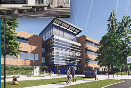
UW-Stout, Heritage Hall