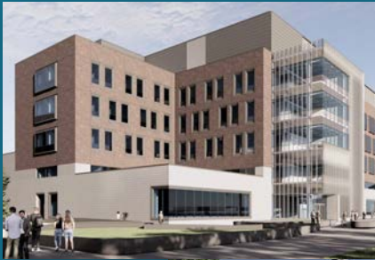
UW-Eau Claire, Science and Health Sciences Building